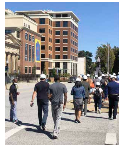
Citygate Nevermore Conference