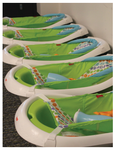
Babies on Board see page 4 for more