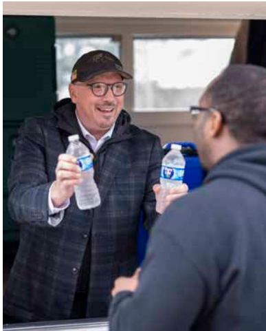
Help is on the Way see page 4 for more

"I am giving back by talking to people needing God's help."