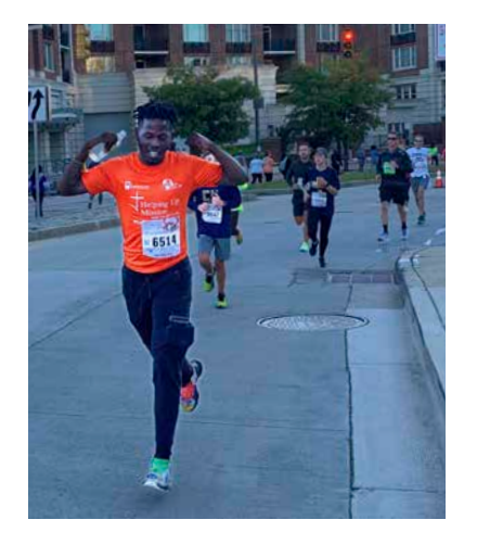
Join Team HUM see page 4 for more